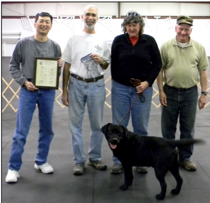
Judges and qualifying teams from the tracking trial on March 21, 2010. Congrats to all!